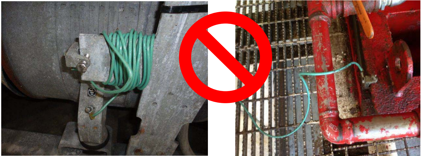
These grounding jumpers do not meet the requirements in API RP 14F/API RP 14FZ

API RP 14F & 14FZ both make a clear requirement that any equipment that has exposed, noncurrent-carrying metal parts that may become energized because of any condition shall be grounded. In this requirement, it is clear that during a fault condition this grounding means must be capable of reliably conducting the ground fault current back to the source of electrical power to activate or trip the electrical circuit protective device. To further clarify, if the equipment is not electrically powered and the metal parts associated with that equipment become energized due to no association with electrically operated equipment, controls, devices, or lighting, then the requirement for approved current carrying conductors, lugs, terminals, etc. should not apply.